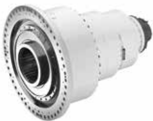
Micro tunnelling Central hollow shaft for suspension passage