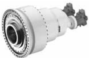
Auger drive For reliable materials handling