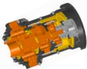
Service concepts Condition Monitoring Downtimes can be reduced with the predictive main- tenance concepts for TBM gearboxes. The Condition Monitoring System »ZMA« also makes it possible to continuously monitor the condition and to calculate the gearbox's remaining service life.