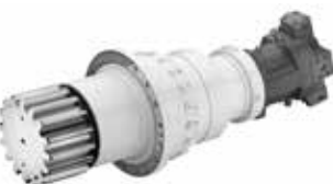
Erector drive For precise handling of segments